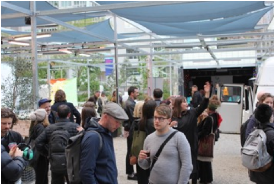
Socialising at ART PARTY #2 in November 2017.