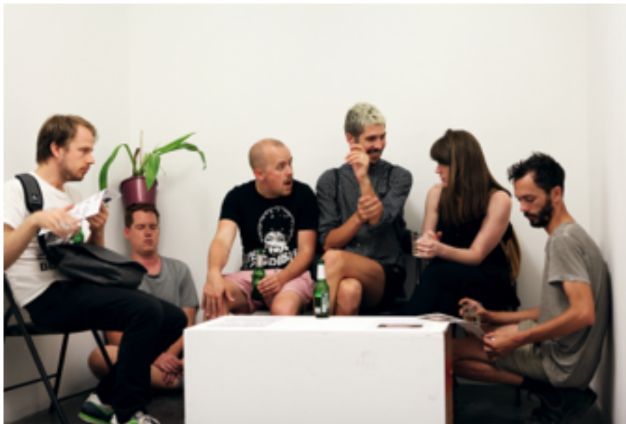
Anonymous Pot Plant Holder, Inanimate Science , performance artwork.